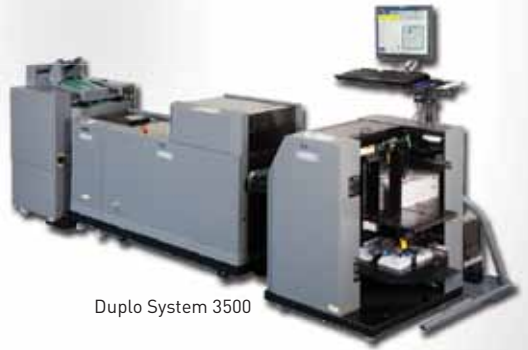
Duplo System 3500