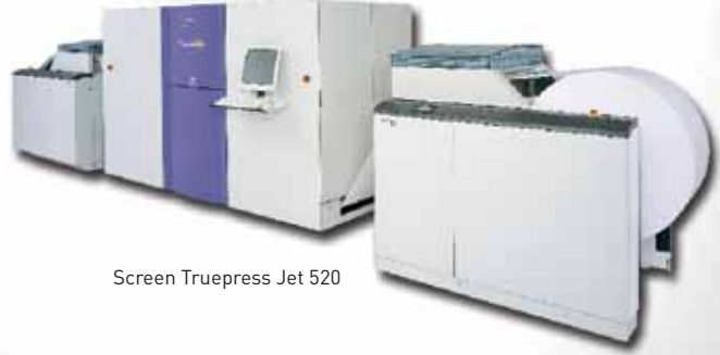
Screen Truepress Jet 520