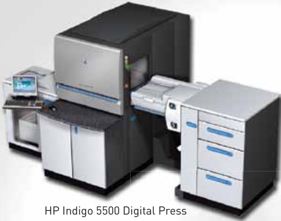
HP Indigo 5500 Digital Press