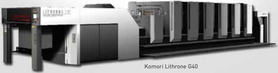
Komori Lithrone G40